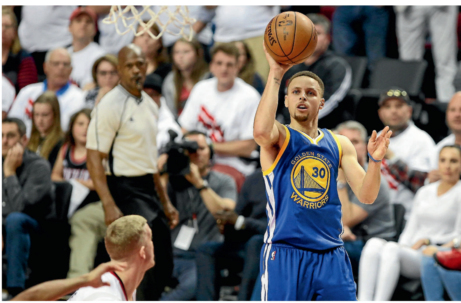
Stephen Curry shoots for one of his 17 points in overtime during the Golden State Warriors' win over the Portland Trail Blazers yesterday.

Australia prevailed 3-2 when the teams most recently met - in Auckland during February last year.